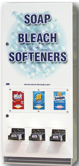
SPV3 - 3 Column