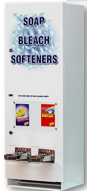
SPV2 - 2 Column