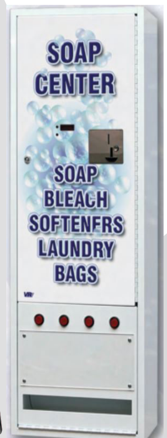
SPV4 - 4 Column