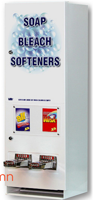
SPV2 - 2 Column