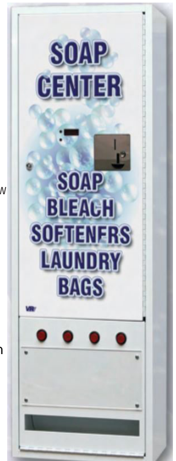
SPV4 - 4 Column